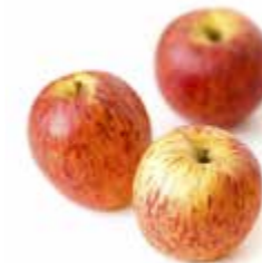
Apple Royal Gala SAP CODE: APP009 PACKING: 4 KG ORIGIN: FRANCE