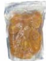
Deshydrated Sliced Pineapple CODE: ANA20 PACKING: 1 KG ORIGIN: VIETNAM