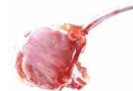
Veal Tomahawk BRAND: La Cave du Boucher SAP CODE: VEA005 PACKING: PCS ORIGIN: FRANCE