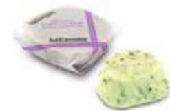
Seaweed Butter BRAND: Beillevaire SAP CODE: BUT111 PACKING: 20 GR X 25 PCS ORIGIN: FRANCE