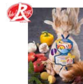
Capon prince de Dombes BRAND: Miéral SAP CODE: CHI024 PACKING: 3,5-4,5 KG X 2 PCS ORIGIN: FRANCE