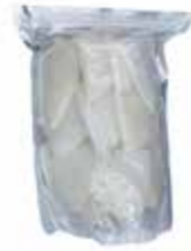
Deshydrated Sliced Coconut SAP CODE: DRY010 PACKING: 1 KG ORIGIN: VIETNAM