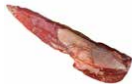
Wagyu Beef Tenderloin A4 BRAND: Nishikidori SAP CODE: MEA236 PACKING: +/- 4 KG ORIGIN: JAPON

Best before date : 45 days Prefecture of cutting : Hyogo