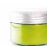
Shiny colour "Emerald" SAP CODE: 001767 PACKING: 200 GR ORIGIN: FRANCE