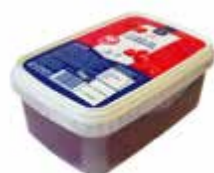
Raspberry Frozen Puree BRAND: METRO Chef SAP CODE: PAS258 PACKING: 1 KG ORIGIN: FRANCE