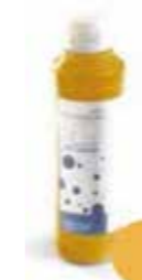
Cocoa Shiny Butter Gold SAP CODE: 004614 PACKING: 200 GR ORIGIN: FRANCE