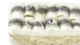
Sweet Rollmops with Juniper JC David SAP CODE: OSE008 PACKING: 20/25 PCS