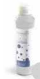
Cocoa Shiny Butter Silver SAP CODE: 004615 PACKING: 200 GR ORIGIN: FRANCE