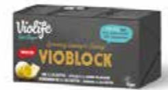
Vegan Fat 79% SAP CODE: CHE365 PACKING: 250 GR ORIGIN: GREECE