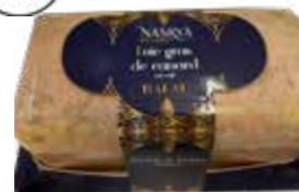
Foie Gras Halal Semi-Cooked SAP CODE: DUC027 PACKING: 270 GR