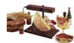
Raclette Machine 1/2 SAP CODE: DOT003 PACKING: PCS ORIGIN: FRANCE