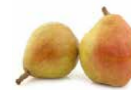
Pear Comice SAP CODE: PEA006 PACKING: 5 KG ORIGIN: FRANCE