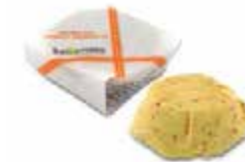
Espelette Pepper Butter BRAND: Beillevaire SAP CODE: BUT112 PACKING: 20 GR X 25 PCS ORIGIN: FRANCE