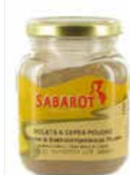
Dry Porcini Powder Sabaro CODE: 73926 PACKING: 100 GR ORIGIN: CHINA