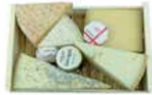
«P'tit Plateau de nos Caves» BRAND: Beillevaire SAP CODE: CHE396 PACKING: 170 GR X 6 PCS ORIGIN: FRANCE