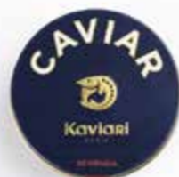
Caviar Sevruga BRAND: Kaviari CODE: 101051 PACKING: 50 GR ORIGIN: EUROPE / CHINA