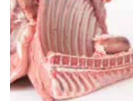
Milk Baby Lamb Rack BRAND: Axuria SAP CODE: LAM020 PACKING: 300 - 350 GR ORIGIN: FRANCE