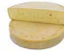
Raclette Goat Milk BRAND: Beillevaire SAP CODE: CHE394 PACKING: 3,25 KG ORIGIN: FRANCE