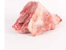
Milk Baby Lamb Front BRAND: Axuria SAP CODE: LAM016 PACKING: 2,1 - 2,5 KG/4PCS ORIGIN: FRANCE