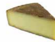
Gruyère d'Alpages 24 Month BRAND: Beillevaire SAP CODE: CHE389 PACKING: 1,875 KG ORIGIN: FRANCE