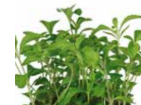
Honny Cress BRAND: Koppert Cress SAP CODE: CRS056 PACKING: 16 PUN ORIGIN: HOLLAND