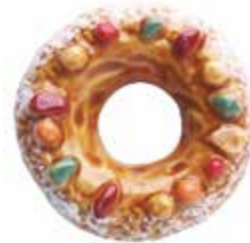
Fève «Epiphanie» SAP CODE: NOF005 PACKING: 100 PCS