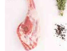
Milk Baby Lamb Suckling Leg BRAND: Axuria SAP CODE: LAM033 PACKING: 1 KG ORIGIN: FRANCE