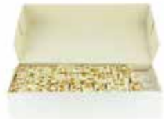
Individual Nougat Montelimart SAP CODE: DRY148 PACKING: 3 KG ORIGIN: FRANCE