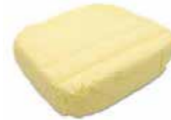
Pasteurised Unsalted Butter BRAND: Beillevaire SAP CODE: BUT108 PACKING: 3 KG ORIGIN: FRANCE