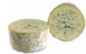
Stilton BRAND: Beillevaire SAP CODE: CHE381 PACKING: 1,875 KG ORIGIN: UK