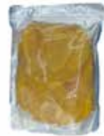
Deshydrated Sliced Mango CODE: MAN20 PACKING: 1 KG ORIGIN: VIETNAM