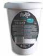
Vegan Creamy SAP CODE: CHE361 PACKING: 500 GR ORIGIN: GREECE