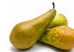
Pear Conference SAP CODE: PEA012 PACKING: 5 KG ORIGIN: FRANCE