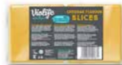
Vegan Cheddar Sliced SAP CODE: CHE364 PACKING: 500 GR ORIGIN: GREECE