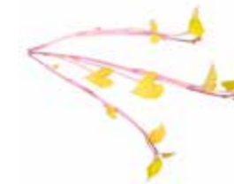
Sweet Peeper BRAND: Koppert Cress SAP CODE: CRS079 PACKING: 2 X 20 PCS ORIGIN: HOLLAND