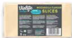
Vegan Mozzarella Sliced SAP CODE: CHE363 PACKING: 500 GR ORIGIN: GREECE