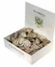
Spéciale Tsarkaya N°4 BRAND: PSK SAP CODE: OYS246 PACKING: 50PCS