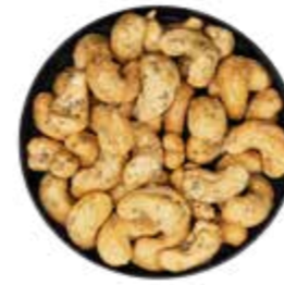
Cashew Thyme flower of salt Esprit Gourmand SAP CODE: DRY534 PACKING: 10 X 1 KG