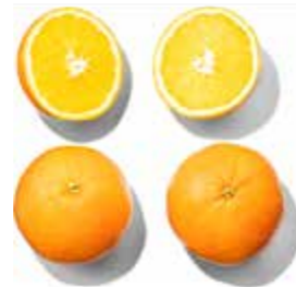
Orange Gamin SAP CODE: CIT052 PACKING: 8 KG ORIGIN: SPAIN