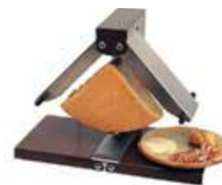
Raclette Machine Breziere SAP CODE: DOT004 PACKING: PCS ORIGIN: FRANCE