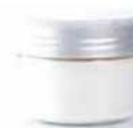
Shiny colour glitter effect "Silver" SAP CODE: 001730 PACKING: 200 GR ORIGIN: FRANCE