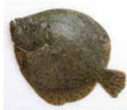
Turbot 5/6 SAP CODE: FLA043 PACKING: 7 KG