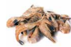
Grey Shrimp Cooked Medium SAP CODE: CRU030 PACKING: 1 KG