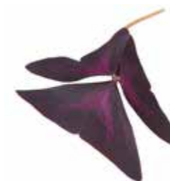
Yka Leaves BRAND: Koppert Cress SAP CODE: CRS082 PACKING: 2 X 15 PCS ORIGIN: HOLLAND