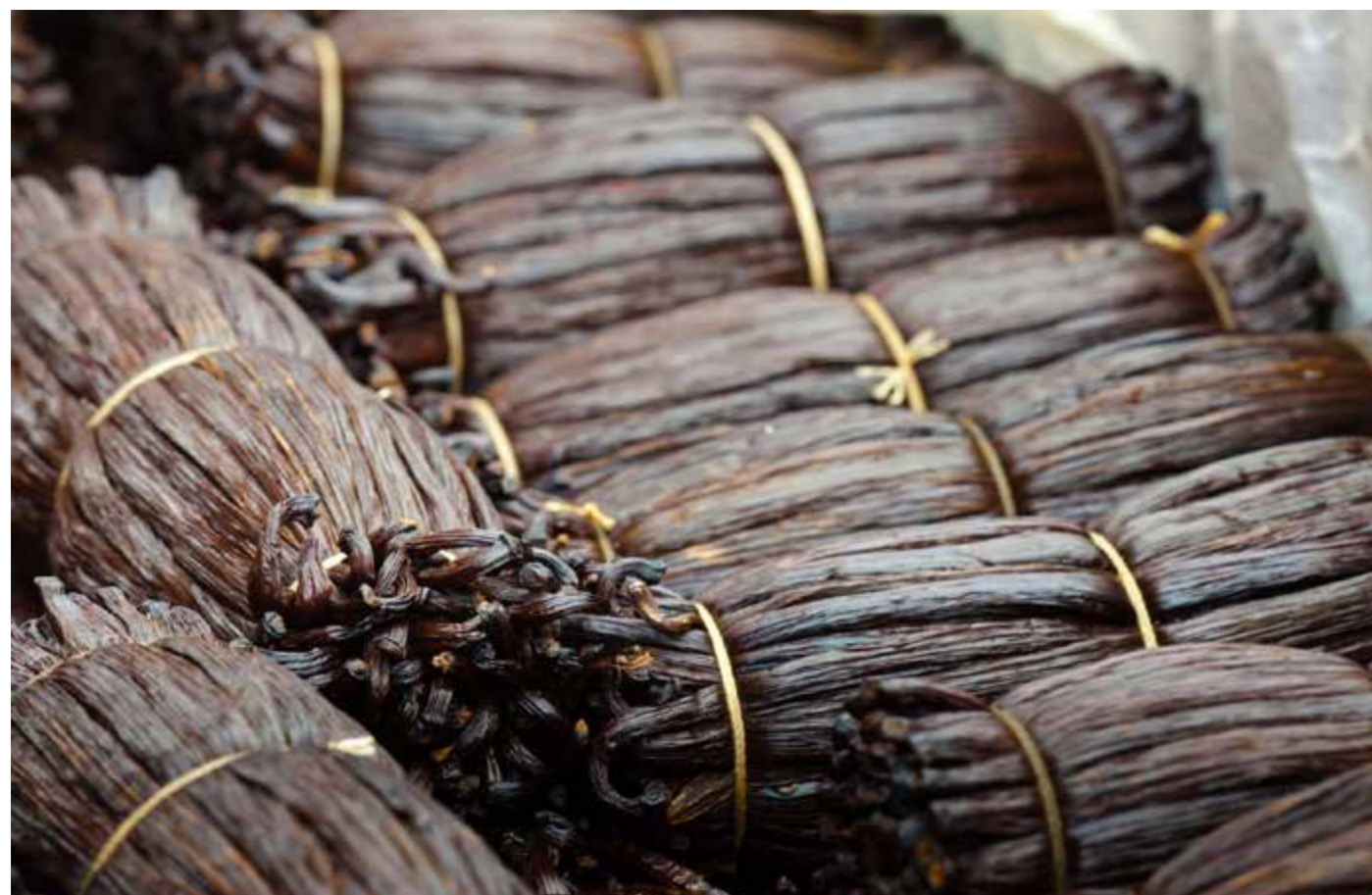
Planifolia Vanilla Pods 16 - 20 cm SAP CODE: PAS033 PACKING: 250 GR ORIGIN: UGANDA