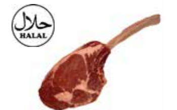
Tomahawk Beef Rib Halal BRAND: Avigros SAP CODE: MEA119 PACKING: 10 KG ORIGIN: HOLLAND