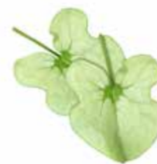
Syrha Leaves BRAND: Koppert Cress SAP CODE: CRS020 PACKING: 2 X 25 PCS ORIGIN: HOLLAND