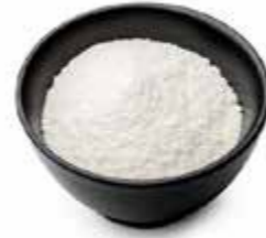
Tant pour Tant BRAND: Esprit Gourmand SAP CODE: DRY540 PACKING: 10 X 1 KG