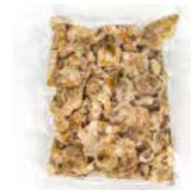
Raw Whole Clams Frozen BRAND: 5DO SAP CODE: CRU053 PACKING: 6 X 1 KG