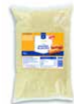
Almond Powder SAP CODE: PAS035 PACKING: 1 KG