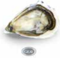
Spéciale de Claire Manrennes d'Oléron N°3 BRAND: Geay SAP CODE: OYS125 PACKING: 25 PCS