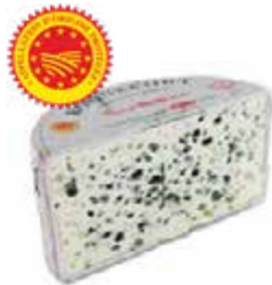
Roquefort Tradition AOP BRAND: Beillevaire SAP CODE: CHE376 PACKING: 1,2 KG ORIGIN: FRANCE