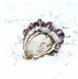
Spéciale Pink Tarbouriech N°3 BRAND: Tarbouriech SAP CODE: OYS015 PACKING: 48 PCS