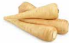
Parsnip BRAND: METRO Sourcing SAP CODE: ROO010 PACKING: 5 KG ORIGIN: FRANCE