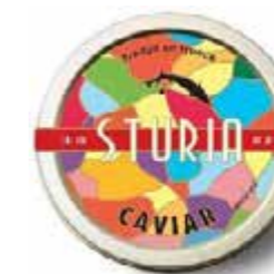
Caviar Origin BRAND: Sturia PACKING: 50 GR ORIGIN: FRANCE