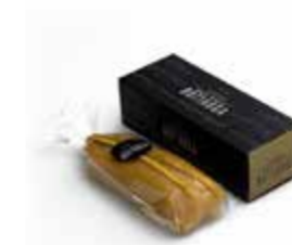
Trikalinos Bottarga SAP CODE: SEA123 PACKING: 200 GR