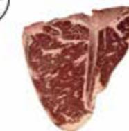
T-Bone Angus Halal BRAND: Avigros SAP CODE: MEA121 PACKING: 10 KG ORIGIN: FRANCE