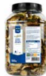
Dry Porcini CODE 275539 PACKING: 500 GR ORIGIN: CHINA