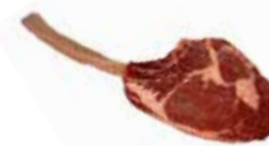
Tomahawk Salers Angus Halal BRAND: Avigros SAP CODE: MEA120 PACKING: 10 KG ORIGIN: FRANCE