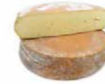
Raclette Wild Garlic BRAND: Beillevaire SAP CODE: CHE395 PACKING: 3,25 KG ORIGIN: FRANCE