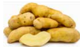
Potatoes Grenaille BRAND: Bayard SAP CODE: POT012 PACKING: 5 KG ORIGIN: FRANCE