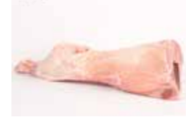
Milk Baby Lamb Baron BRAND: Axuria SAP CODE: LAM017 PACKING: 4-5 KG ORIGIN: FRANCE