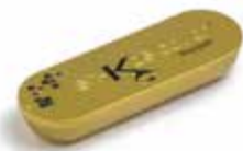
En-K Transmontanus Gold BRAND: Kaviari SAP CODE: ROE021 PACKING: 15 GR ORIGIN: ITALY