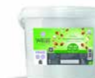
Almond Marcona Praliné SAP CODE: PAS250 PACKING: 5 KG ORIGIN: SPAIN