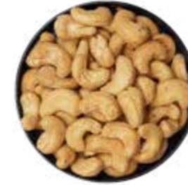
Cashew Truffle Esprit Gourmand SAP CODE : DRY535 PACKING: 10 X 1 KG