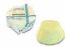
Unpasteurised Unsalted Butter BRAND: Beillevaire SAP CODE: BUT106 PACKING: 20 GR X 50 PCS ORIGIN: FRANCE