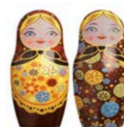
Matriochkas Dark choc "Classique" 2 SAP CODE: 070010 PACKING: 200 GR ORIGIN: FRANCE