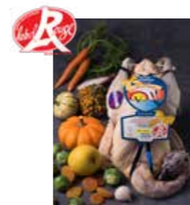
Guinea Fowl Prince de Dombes BRAND: Miéral SAP CODE: CHI017 PACKING: 1,6 - 2 X 6 PCS ORIGIN: FRANCE