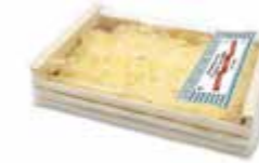
Fondue Savoyarde Mix BRAND: Beillevaire SAP CODE: CHE390 PACKING: 300 GR X 4 PCS ORIGIN: FRANCE