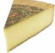
Etivaz BRAND: Beillevaire SAP CODE: CHE384 PACKING: 1,375 KG ORIGIN: SWITZERLAND