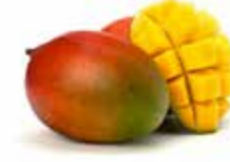
Mango kent SAP CODE: EXF005 PACKING: 6 KG ORIGIN: PERU