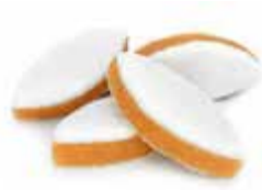
Calissons SAP CODE: PAS268 PACKING: 3 KG ORIGIN: FRANCE