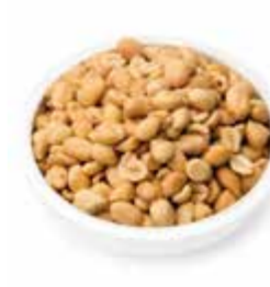
Salted Peanut Esprit Gourmand SAP CODE: DRY536 PACKING: 10 X 1 KG