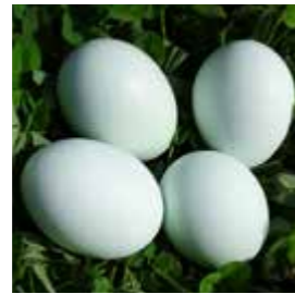
Organic Wild Range Azure Egg BRAND: MONT ST PÈRE SAP CODE: EGG002 PACKING: 16 X 6 PCS ORIGIN: FRANCE