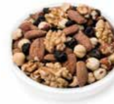
Megève blend Esprit Gourmand SAP CODE: DRY538 PACKING: 10 X 1 KG