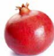
Pomegranata SAP CODE: EXF016 PACKING: 3,8 KG ORIGIN: SPAIN