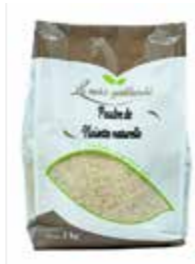
Hazelnut Powder SAP CODE: PAS218 PACKING: 1 KG