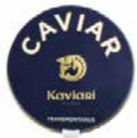
Caviar Transmontanus BRAND: Kaviari CODE: 122051 PACKING: 50 GR ORIGIN: ITALY