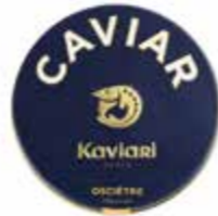
Caviar Oscietre Prestige BRAND: Kaviari CODE: 113051 PACKING: 50 GR ORIGIN: EUROPE / CHINA