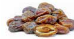
Fresh Date Deglet SAP CODE: DAT007 PACKING: 3 KG ORIGIN: ALGERIA

Located at the foot of Mount Canigou, the village of Eus is the sunniest in France and offers an ideal climate for citrus development. Agrumes Bachès has been selecting for more than 20 years fruits with unique aromatic palettes, resulting from an exceptional know-how. Ideal to stimulate the creativity of passionate chefs and pastry chefs, in search of freshness or bitterness. Thank you Perrine and Etienne for this work. The pastry chefs thank you!