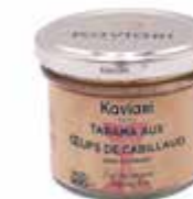
White Tarama Kaviari SAP CODE: OSE007 PACKING: 1 KG X 6 PCS