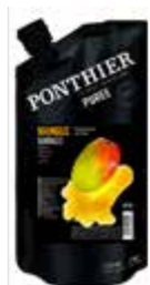
Mango Frozen Puree BRAND: Ponthier SAP CODE: PAS255 PACKING: 1 KG ORIGIN: FRANCE