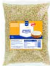
Almond Chopped SAP CODE: PAS262 PACKING: 1 KG