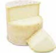
Persillé de Tignes BRAND: Beillevaire SAP CODE: CHE377 PACKING: 900 GR ORIGIN: FRANCE