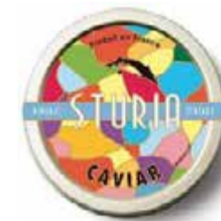
Caviar Vintage BRAND: Sturia PACKING: 50 GR ORIGIN: FRANCE