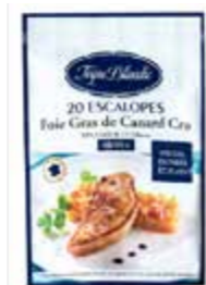
Duck Foie Gras Sliced 40/60 Frozen SAP CODE: DUC072 PACKING: 40-60 GR X 20 PCS