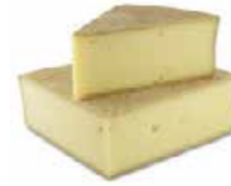
Abondance Fermière BRAND: Beillevaire SAP CODE: CHE383 PACKING: 1,125 KG ORIGIN: FRANCE