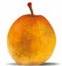
Pear Passe Crassane SAP CODE: PEA011 PACKING: 4 KG ORIGIN: FRANCE