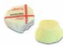
Unpasteurised Salted Butter BRAND: Beillevaire SAP CODE: BUT105 PACKING: 20 GR X 50 PCS ORIGIN: FRANCE