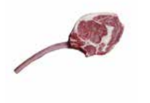
Tomahawk Aubrac 50/70 days BRAND: La Cave du Boucher SAP CODE: MEA057 PACKING: PCS ORIGIN: FRANCE