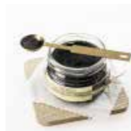
Vanilla pearl SAP CODE: PAS262 PACKING: 100 GR ORIGIN: MADAGASCAR