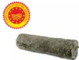
Saint-Maure de Touraine AOP BRAND: Beillevaire SAP CODE: CHE375 PACKING: 300 GR X 3 PCS ORIGIN: FRANCE