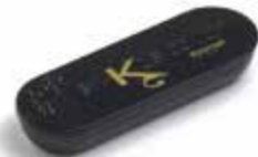
En-K Oscietre Black BRAND: Kaviari SAP CODE: ROE022 PACKING: 15 GR ORIGIN: EUROPE / CHINA