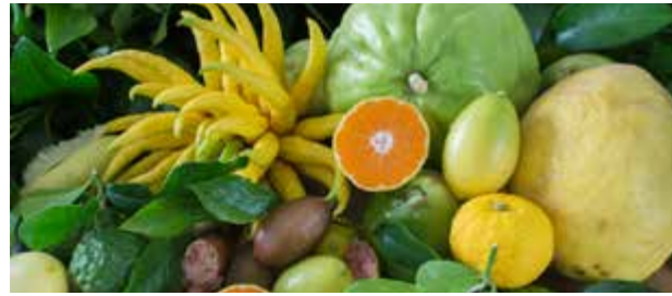
Citrus Mix BRAND: Bachès SAP CODE: CIT028 PACKING: 2 KG ORIGIN: FRANCE