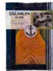
Smoked Salmon Sliced Fillet BRAND: Onake SAP CODE: SMO022 PACKING: 1,8 - 2,2 KG / PCS ORIGIN: SCOTLAND