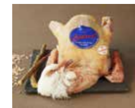
Pigeon Excellence Eviscerated BRAND: Miéral SAP CODE: GAM013 PACKING: 450-650 X 10PCS ORIGIN: FRANCE