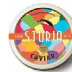
Caviar Grand Cru BRAND: Sturia PACKING: 50 GR ORIGIN: FRANCE