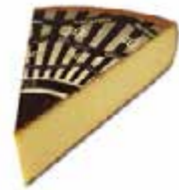
Comté 24 Month BRAND: Beillevaire SAP CODE: CHE386 PACKING: 2,19 KG ORIGIN: FRANCE