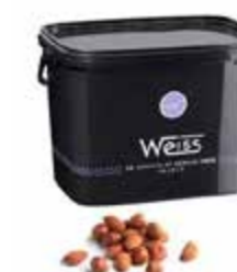
Almond and Hazelnut Marcona Praliné Smooth SAP CODE: PAS251 PACKING: 5 KG ORIGIN: SPAIN