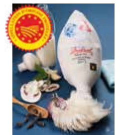
Bresse Female in Cloth BRAND: Miéral SAP CODE: CHI035 PACKING: 2,2-2,7 KG / PC ORIGIN: FRANCE