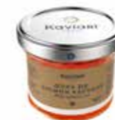
Wild Salmon Roes Kaviari SAP CODE: ST041 PACKING: 100 GR X 12 PCS