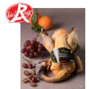
Turkey Prince de Dombes BRAND: Miéral SAP CODE: CHI029 PACKING: 3,5-4,5 KG X 2 PCS ORIGIN: FRANCE