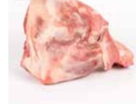
Milk Baby Lamb Shoulder BRAND: Axuria SAP CODE: LAM013 PACKING: 1 KG ORIGIN: FRANCE