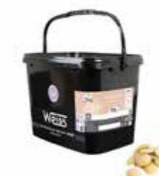
White Chocolate Drops NEVEA 29% SAP CODE: PAS245 PACKING: 5 KG ORIGIN: BLEND

All the products are made in Saint-Etienne from the cocoa bean to the fondette.