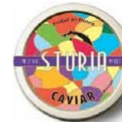
Caviar Prestige Baerii BRAND: Sturia PACKING: 50 GR ORIGIN: FRANCE