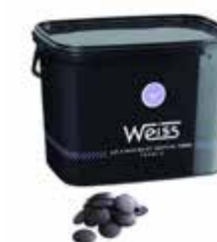
Dark Chocolate Drops ADZOPE 55% SAP CODE: PAS246 PACKING: 5 KG ORIGIN: BLEND