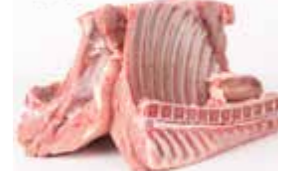
Milk Baby Lamb Half Ribs BRAND: Axuria SAP CODE: LAM012 PACKING: 400 - 700 GR ORIGIN: FRANCE