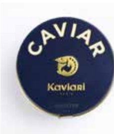
Caviar Oscietre Gold BRAND: Kaviari CODE: 116051 PACKING: 50 GR ORIGIN: EUROPE / CHINA