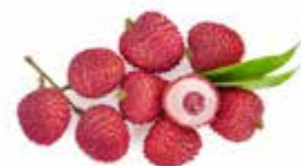
Litchi SAP CODE: EXF028 PACKING: 2 KG ORIGIN: MADAGASCAR