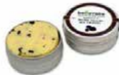
Truffle butter BRAND: Beillevaire SAP CODE: BUT110 PACKING: 48 GR X 8 PCS ORIGIN: FRANCE