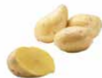
Potatoes Andean Sunside BRAND: Bayard SAP CODE: POT023 PACKING: 5 KG ORIGIN: FRANCE

Elongated and curved, its yellow, fine flesh and its nutty taste make it very appreciated by gourmets.