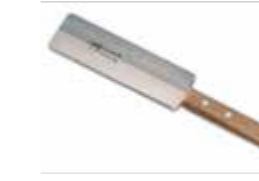
Raclette Knife SAP CODE: DOT005 PACKING: PCS ORIGIN: FRANCE