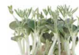
Lupine Cress BRAND: Koppert Cress SAP CODE: CRS063 PACKING: 16 PUN ORIGIN: HOLLAND