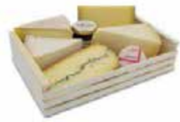
«Cagette de nos Caves» BRAND: Beillevaire SAP CODE: CHE387 PACKING: 845 GR X 4 PCS ORIGIN: FRANCE