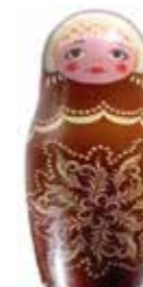
Matriochkas Dark choc "Merveille" SAP CODE: 070009 PACKING: 200 GR ORIGIN: FRANCE