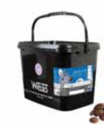
Milk Chocolate Drops GALAXIE 41% SAP CODE: PAS248 PACKING: 5 KG ORIGIN: BLEND