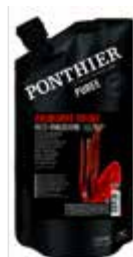
Strawberry Frozen Puree BRAND: Ponthier SAP CODE: PAS254 PACKING: 1 KG ORIGIN: FRANCE