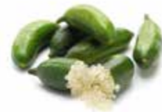
Finger Lime BRAND: Bachès SAP CODE: CIT008 PACKING: KG ORIGIN: FRANCE