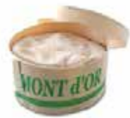
Vacherin Mont d'Or BRAND: Beillevaire SAP CODE: CHE378 PACKING: 400 GR ORIGIN: FRANCE