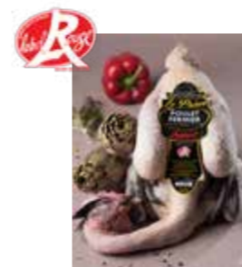
Black Chicken «le Prince» BRAND: Miéral SAP CODE: CHI080 PACKING: 1,6-2,6 X 2 PCS ORIGIN: FRANCE