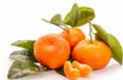
Clementine with Leaves SAP CODE: CIT031 PACKING: 8 KG ORIGIN: SPAIN