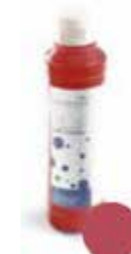
Cocoa Butter Red SAP CODE: 004609 PACKING: 200 GR ORIGIN: FRANCE