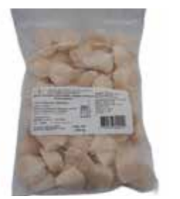
Scallops Meat 10/20 Frozen BRAND: METRO SAP CODE: on demand