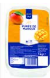
Mango Frozen Puree BRAND: METRO Chef SAP CODE: PAS261 PACKING: 1 KG ORIGIN: FRANCE