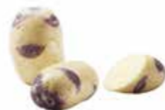
Potatoes Blue Belle BRAND: Bayard SAP CODE: POT009 PACKING: 5 KG ORIGIN: FRANCE