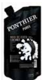
Coconut Frozen Puree BRAND: Ponthier SAP CODE: PAS257 PACKING: 1 KG ORIGIN: FRANCE