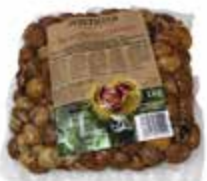
Chestnut Vacuum SAP CODE: 77737 PACKING: 1 KG BRAND : Ponthier ORIGIN: FRANCE