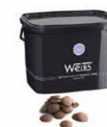
Milk Chocolate Drops MADALAIT 35% SAP CODE: PAS247 PACKING: 5 KG ORIGIN: BLEND