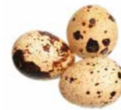
Quail Egg BRAND: METRO Sourcing SAP CODE: QUA004 PACKING: 18 PCS ORIGIN: FRANCE