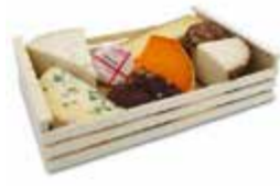
«Cagette de Saison» BRAND: Beillevaire SAP CODE: CHE388 PACKING: 800 GR X 3 PCS ORIGIN: FRANCE