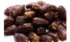
Fresh Date Medjool Jumbo SAP CODE: DAT003 PACKING: 3,5 KG ORIGIN: ISRAEL