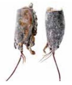
Blue Lobster Head Frozen BRAND: 5DO SAP CODE: CRU042 PACKING: 5 KG