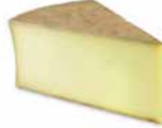
Beaufort d'Été BRAND: Beillevaire SAP CODE: CHE391 PACKING: 2,81 KG ORIGIN: FRANCE