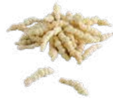
Crosne BRAND: METRO Sourcing SAP CODE: ROO006 PACKING: 2 KG ORIGIN: FRANCE