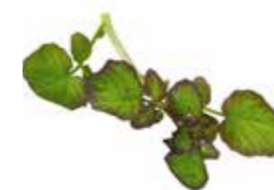
Hippo Tops BRAND: Koppert Cress SAP CODE: CRS055 PACKING: 200 GR X 2 PCS ORIGIN: HOLLAND