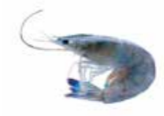
Blue Shrimp New Caledonian Frozen BRAND: Obsiblu SIZE: 21/25 -21/30 -31/40-41/50 PACKING: 6 X 1 KG