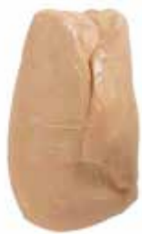
Lobes of Duck Deveined 500/600 GR SAP CODE: DUC075 PACKING: 5 PCS