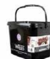
Cocoa Powder 100% SAP CODE: PAS249 PACKING: 4 KG ORIGIN: AFRICA