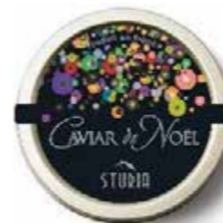
Caviar Christmas BRAND: Sturia D PACKING: 50 GR ORIGIN: FRANCE