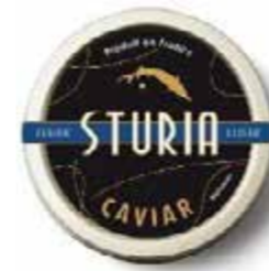
Caviar Baerii Classic BRAND: Sturia PACKING: 50 GR ORIGIN: FRANCE