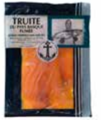
Smoked Trout Sliced Fillet BRAND: Onake SAP CODE: SMO018 PACKING: 650 GR / PCS ORIGIN: SCOTLAND