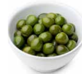
Olive noceralla Esprit Gourmand SAP CODE: DRY539 PACKING: 10 X 1 KG