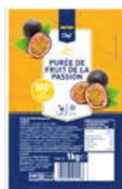
Passion Frozen Puree BRAND: METRO Chef SAP CODE: PAS260 PACKING: 1 KG ORIGIN: FRANCE