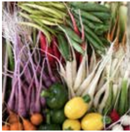
Rtour du Jardin BRAND: Eric ROY SAP CODE: BVE039 PACKING: 250 PCS ORIGIN: FRANCE