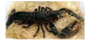
Blue Lobster 6/800 SAP CODE: CRU003 PACKING: 3 KG