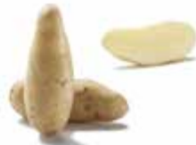
Potatoes Ratte de Santerre BRAND: Bayard SAP CODE: POT006 PACKING: 5 KG ORIGIN: FRANCE