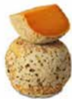
Mimolette vieille 18 month BRAND: Beillevaire SAP CODE: CHE382 PACKING: 3 KG ORIGIN: FRANCE