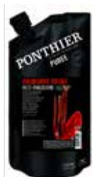
Rhubarb Frozen Puree BRAND: Ponthier SAP CODE: PAS253 PACKING: 1 KG ORIGIN: FRANCE