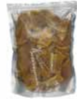
Deshydrated Sliced Passion CODE: FPA20 PACKING: 1 KG ORIGIN: VIETNAM