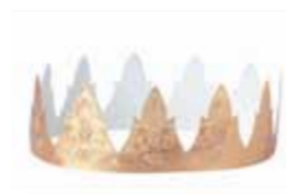
Gold Crown X100 SAP CODE: NOF007 PACKING: 100 PCS