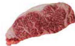
Wagyu Beef Striploin A4 BRAND: Nishikidori SAP CODE: MEA232 PACKING: +/- 2 KG ORIGIN: JAPON