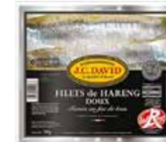
Smoked Herring fillets 1KG JC David SAP CODE: SEA116 PACKING: 12 PCS