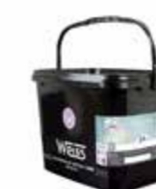
White Chocolate Drops ANEO 34% SAP CODE: PAS246 PACKING: 5 KG ORIGIN: BLEND