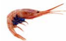
Blue Belly Shrimp 1/200 Frozen BRAND: Hispamarée SAP CODE: CRU054