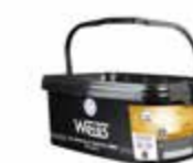
Sesame Praliné SAP CODE: PAS252 PACKING: 2,5 KG ORIGIN: FRANCE