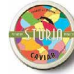
Caviar Primeur BRAND: Sturia PACKING: 50 GR ORIGIN: FRANCE