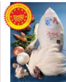
Bresse Capon in Cloth BRAND: Miéral SAP CODE: CHI004 PACKING: 3-5 KG / PC ORIGIN: FRANCE

Poultry farmer since 1919, it is with more than 100 years of know-how and 4 generations that the Miéral family proposes its poultries to the greatest tables of the whole world. The poultries are raised in the open air and benefit from a 100% natural food while respecting the soil.