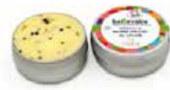
Caviar Butter BRAND: Beillevaire SAP CODE: BUT109 PACKING: 48 GR X 8 PCS ORIGIN: FRANCE