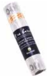
Pressed and Dried Caviar BRAND: Kaviari CODE: 128051 PACKING: 50 GR ORIGIN: EUROPE