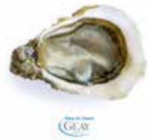
Fine de Claire Marennes Oléron N°3 BRAND: Geay SAP CODE: OYS100 PACKING: 50 PCS