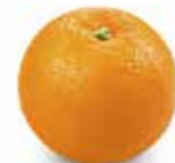
Orange for juice SAP CODE: CIT045 PACKING: 9 KG ORIGIN: SPAIN