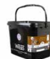
Dark Chocolate Drops ACARIGUA 70% SAP CODE: PAS246 PACKING: 5 KG ORIGIN: BLEND