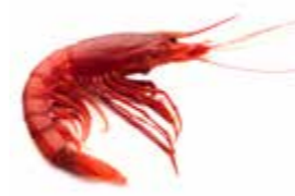
Gambero Rosso 15/25 Frozen BRAND: Hispamarée SAP CODE: CRU055