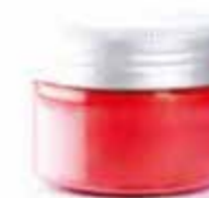
Shiny colour "Red" SAP CODE: 001196 PACKING: 200 GR ORIGIN: FRANCE