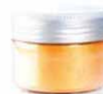
Shiny colour glitter effect "Gold" SAP CODE: 001782 PACKING: 200 GR ORIGIN: FRANCE