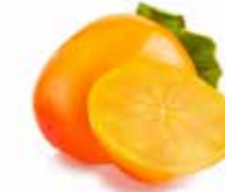
Parsimmon SAP CODE: EXF072 PACKING: 3,5 KG ORIGIN: SPAIN