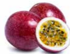
Passion Fruit SAP CODE: EXF061 PACKING: 2 KG ORIGIN: COLOMBIA