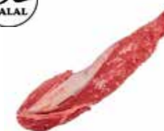
Angus Tenderloin Halal BRAND: Avigros SAP CODE: MEA122 PACKING: 10 KG ORIGIN: IRLAND