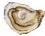
Spéciale Perle Blanche N°5 BRAND: Reynaud SAP CODE: OYS356 PACKING: 48 PCS