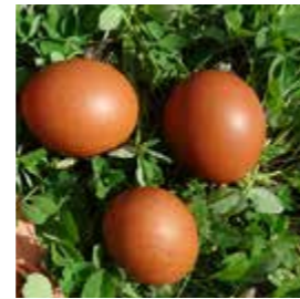
Organic Wild Marrans Egg BRAND: MONT ST PÈRE SAP CODE: EGG010 PACKING: 16 X 6 PCS ORIGIN: FRANCE