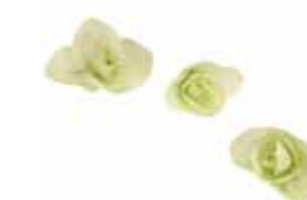
Floregano BRAND: Koppert Cress SAP CODE: CRS029 PACKING: 2 X 20 PCS ORIGIN: HOLLAND