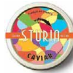
Caviar Oscietra BRAND: Sturia PACKING: 50 GR ORIGIN: FRANCE