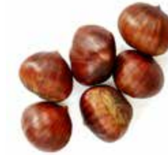
Fresh Chestnut SAP CODE: NUT001 PACKING: 5 KG ORIGIN: FRANCE