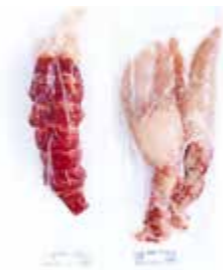
Blue Lobster Tail and Claw Frozen BRAND: 5DO SAP CODE: CRU052 PACKING: 140-190 GR