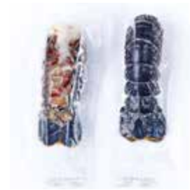
Lobster Tail with Shell Frozen BRAND: 5DO SAP CODE: CRU036 PACKING: 240/300 GR X 10 PCS