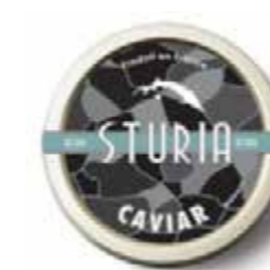
Caviar French Beluga BRAND: Sturia PACKING: 50 GR ORIGIN: FRANCE