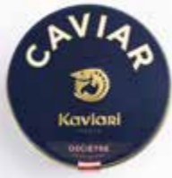
Caviar Oscietre big BRAND: Kaviari CODE: 129051 PACKING: 50 GR ORIGIN: CHINA