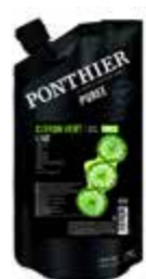
Lime Frozen Puree BRAND: Ponthier SAP CODE: PAS256 PACKING: 1 KG ORIGIN: FRANCE