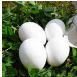
Organic Wild Range White Egg BRAND: MONT ST PÈRE SAP CODE: EGG003 PACKING: 16 X 6 PCS ORIGIN: FRANCE