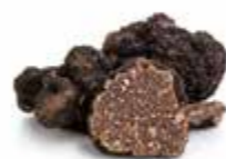
Black Truffle Melanosporum BRAND: JMC Truffles SAP CODE: TRU007 PACKING: Price/KG ORIGIN: FRANCE