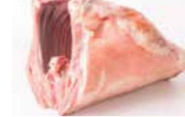
Milk Baby Lamb Chest BRAND: Axuria SAP CODE: LAM018 PACKING: 1,6 - 3,2 KG ORIGIN: FRANCE