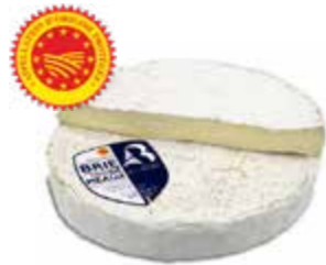
Brie de Meaux AOP BRAND: Beillevaire SAP CODE: CHE385 PACKING: 3 KG ORIGIN: FRANCE