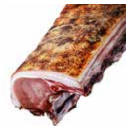
Bougnat Pork «Fermier» BRAND: La Cave du Boucher SAP CODE: PORC009 PACKING: PCS ORIGIN: FRANCE