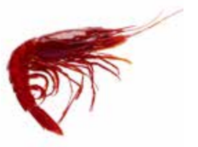
Carabineros 8/10 Frozen BRAND: 5DO SAP CODE: CRU054 PACKING