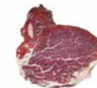
Simmental Fillet BRAND: La Cave du Boucher SAP CODE: MEA013 PACKING: PCS ORIGIN: FRANCE