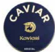
Caviar Kristal BRAND: Kaviari CODE: 115051 PACKING: 50 GR ORIGIN: CHINA