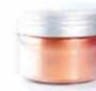
Shiny colour "Bronze" SAP CODE: 002247 PACKING: 200 GR ORIGIN: FRANCE