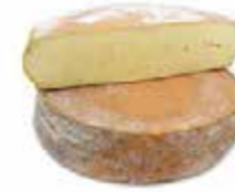
Raclette Summer Truffle BRAND: Beillevaire SAP CODE: CHE393 PACKING: 3,25 KG ORIGIN: FRANCE