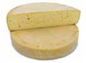
Raclette grand Cru BRAND: Beillevaire SAP CODE: CHE392 PACKING: 3 KG ORIGIN: FRANCE