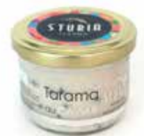
Caviar Tarama Sturia SAP CODE: ROE034 PACKING: 90 GR