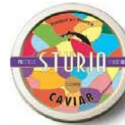
Caviar Prestige Oscietre BRAND: Sturia PACKING: 50 GR ORIGIN: FRANCE