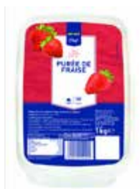
Strawberry Frozen Puree BRAND: METRO Chef SAP CODE: PAS259 PACKING: 1 KG ORIGIN: FRANCE