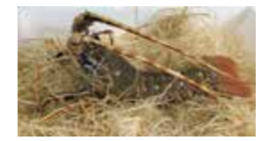
Spiny Royal Lobster 800/1 SAP CODE: CRU027 PACKING: 6 KG