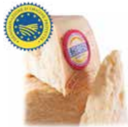
Parmigiano Reggiano DOP BRAND: Beillevaire SAP CODE: CHE380 PACKING: 2,19 KG ORIGIN: ITALY