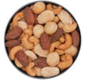
Paris blend Esprit Gourmand SAP CODE: DRY537 PACKING: 10 X 1 KG