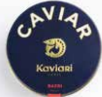
Caviar Baeri Royal BRAND: Kaviari CODE: 111051 PACKING: 50 GR ORIGIN: EUROPE / CHINA