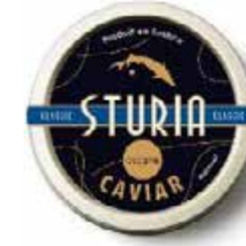
Caviar Oscietre Classic BRAND: Sturia PACKING: 50 GR ORIGIN: FRANCE