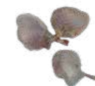
Quail Leg SAP CODE: QUA026 PACKING: 8 PCS ORIGIN: SPAIN