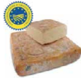
Taleggio di Grotta DOP BRAND: Beillevaire SAP CODE: CHE379 PACKING: 2,6 KG ORIGIN: ITALY