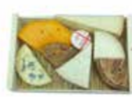
«P'tit Plateau de Saison» BRAND: Beillevaire SAP CODE: CHE397 PACKING: 170 GR X 6 PCS ORIGIN: FRANCE