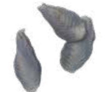
Quail Fillet SAP CODE: QUA027 PACKING: 20 PCS ORIGIN: SPAIN