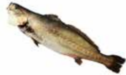
Farmed Meager Red Label 3/4 BRAND: Aquadea SAP CODE: MEH015 PACKING: 7 KG