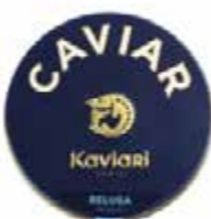
Caviar Beluga Impérial BRAND: Kaviari CODE: 112051 PACKING: 50 GR ORIGIN: EUROPE / CHINA