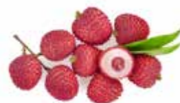
Litchi in Bunch SAP CODE: EXF027 PACKING: 5 KG ORIGIN: RÉUNION